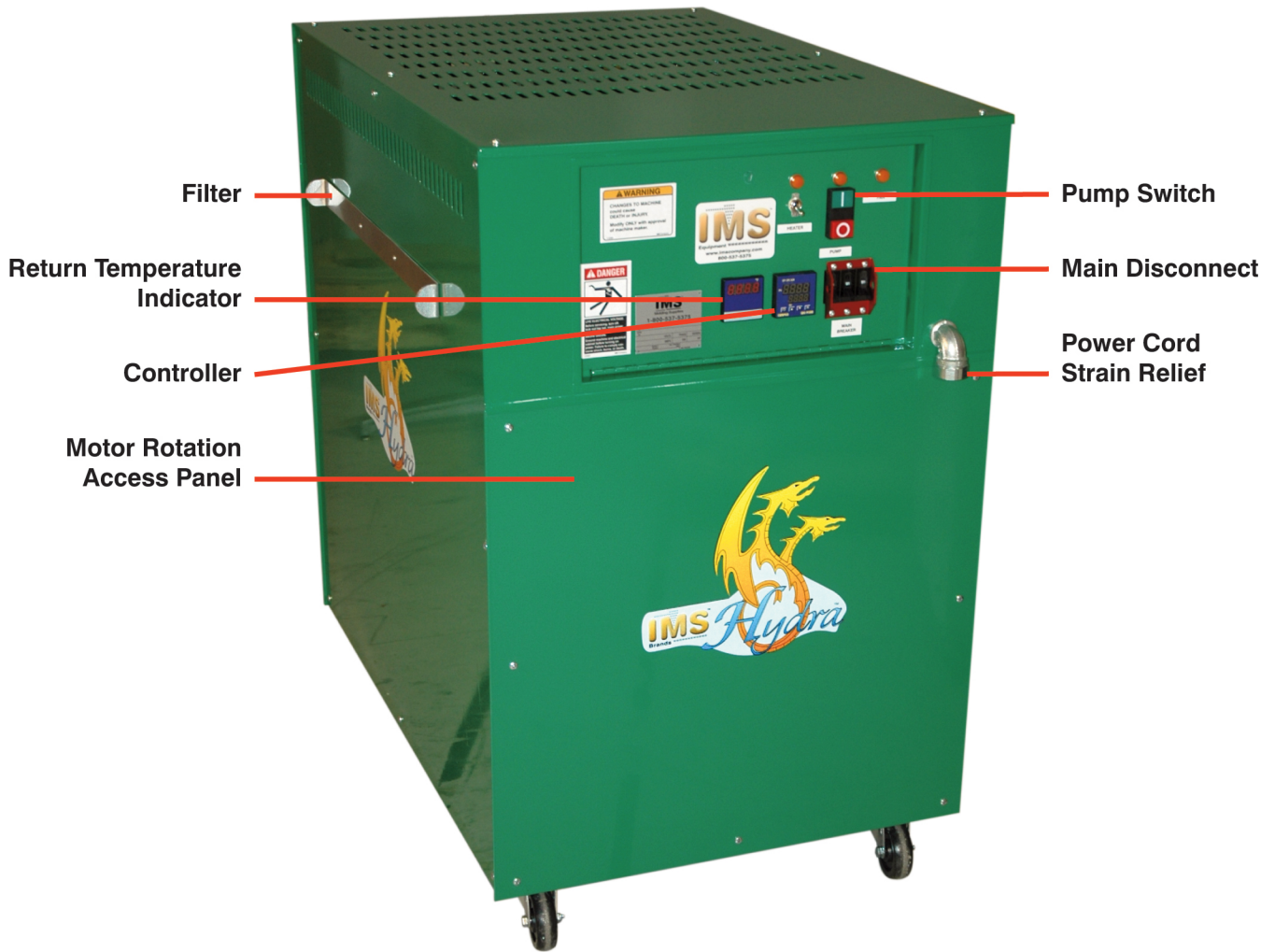
Figure 1 FRONT AND LEFT SIDE VIEW